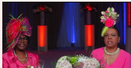
PIEF Executive Director & President