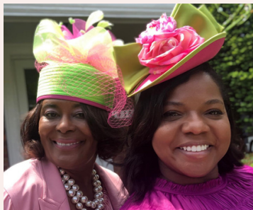
2021 Pink Hat Tea Co-Chairs