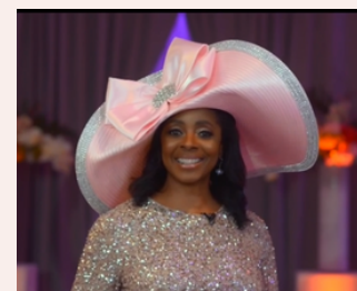
Mistress of Ceremony