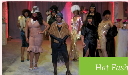
Hat Fashion Show