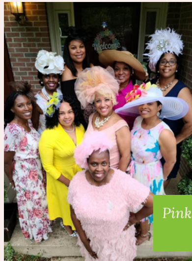
Pink Hat Tea Guests in their Homes